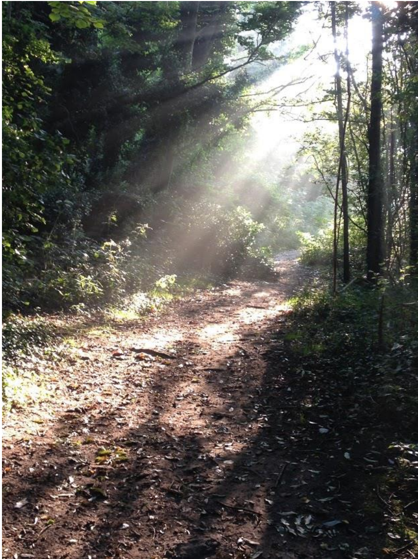
Sun and Shade

On-going scrub clearance and regeneration of heather are also important tasks which assist in improving growing conditions for plants by increasing the sunlight and airflow to them. This year the task has been one of maintaining the scrub clearance across all commons rather than concentrating on clearing larger areas of one common.