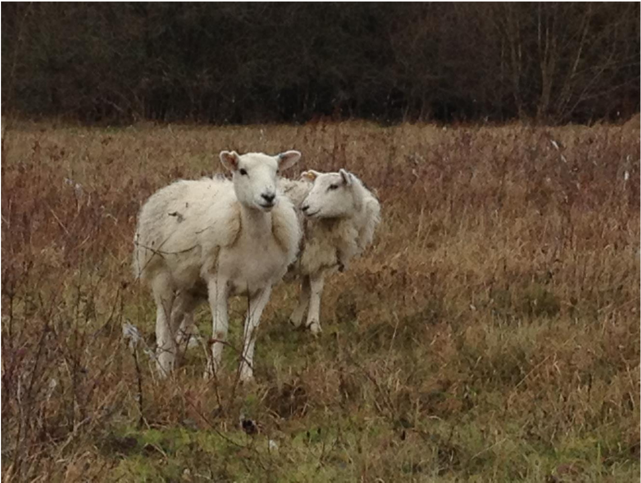
Grazing on the Downs