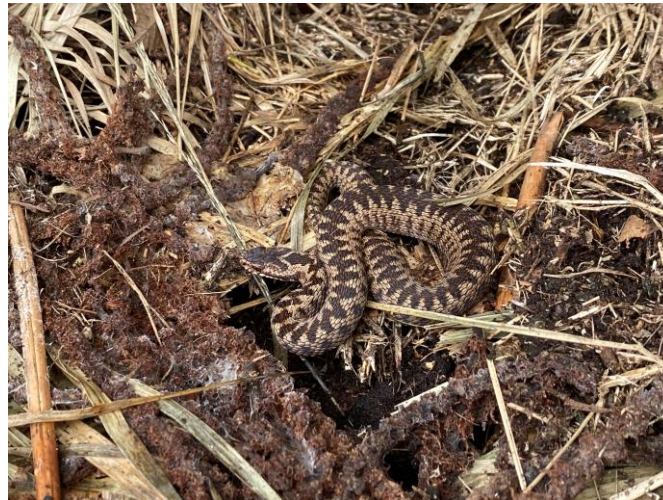
Juvenile Adder recorded on Banstead Heath in March 2021

Reptile monitoring has commenced on Banstead Heath and 12 tin refuges have been placed across the Heath to help monitor the population of Adders and other reptiles. Data is collected in-house and all sightings reported to Surrey Amphibian and Reptile Group.