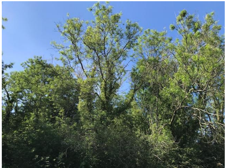
Picture of the canopy on an Ash at Banstead Heath

Ash Die-Back is widespread on Banstead Commons and the team are prioritising the felling of trees that are likely to cause damage, injury or obstruction to roads, people of property. In some areas we have combined forces with the Greenspaces Team at Reigate and Banstead Borough Council to work on stands and individual trees which are beyond our resources, either due to the road network or the risk the tree works pose to neighbouring properties. It is estimated that we will lose 80% of our ash trees to the disease and the tree works will be a significant drain on resources for the next five years.