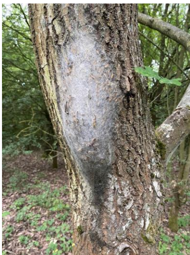
Oak processionary moth nest

Oak Processionary Moth (OPM) has extended its reach across Surrey and additional nests were reported on Banstead Downs this year; we are expecting OPM to arrive at our other sites in the foreseeable future. Due to the SSI designation on Banstead Downs the nests were removed manually, without any chemical treatment.