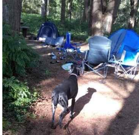
Encampment on Banstead Heath

Motorbike and Quad Bikes continue to cause problems on Banstead Downs and Burgh Heath. Wherever possible vehicular access to the Commons has been blocked off but as the sites available for tipping are numerous, the problem persists. The local community has risen to the challenge and we have seen the formation of Litter Picking Groups through social media and our sincere thanks go to all those who are helping us to preserve and protect Banstead Common for the enjoyment of the local community and wildlife.